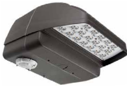
WPA-15B, and 24B

**Default setting at time of shipping are highest wattage and highest CCT.